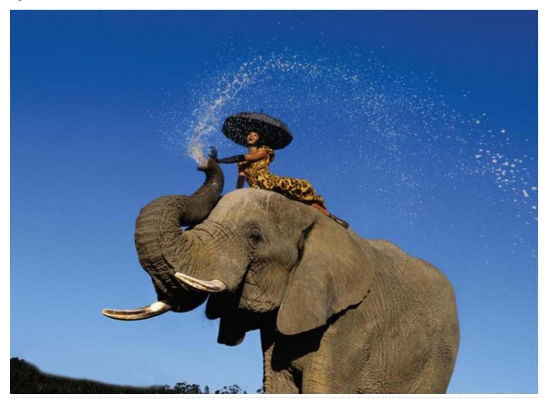
A Jean Paul Goude photograph.

For a man who rarely speaks with the media, photographer Jean-Paul Goude is surprisingly candid when such an occasion arises. Or maybe that's precisely why he doesn't often talk to reporters. For more than 30 years, Goude's private life and work have been inextricably linked, and as a result, his work has become a running biography of the childish reveries of early years, his complicated relationships and his exotic fantasies.